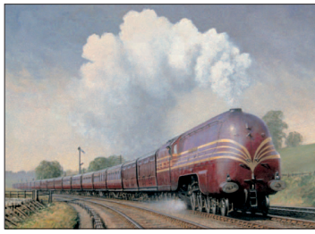
LMS POWER The 'Coronation' class Edward Talbot